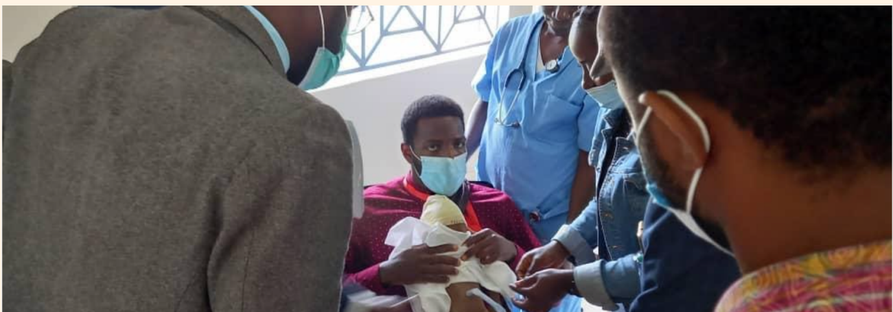
Medical Professionals at Jos University Training Hospital and APM Personnel simulating technics