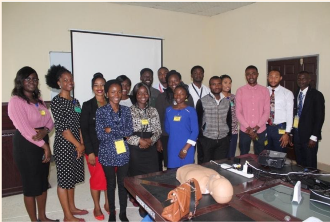
2021 JUTH APM CME Participants after a successful training

A major highlight for APMN and JUTH came when they awarded 66 of the 105 attendees with scholarships to attend the conference.